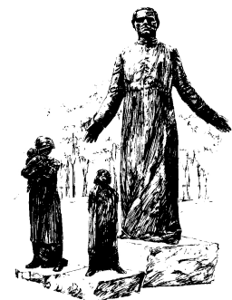
Please pray for our Brothers, Blessed Fr. McGivney.